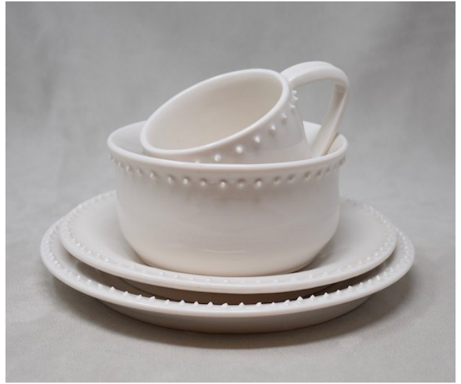
Meg Walker '19 "Cone 6 Porcelain"

Art is intrinsic to everyone's life and is a universal language, therefore our overall objective is to empower students to not only succeed in the coursework, but to provide them with the confidence to excel in many endeavors with the positive self-image developed through participation in the arts.